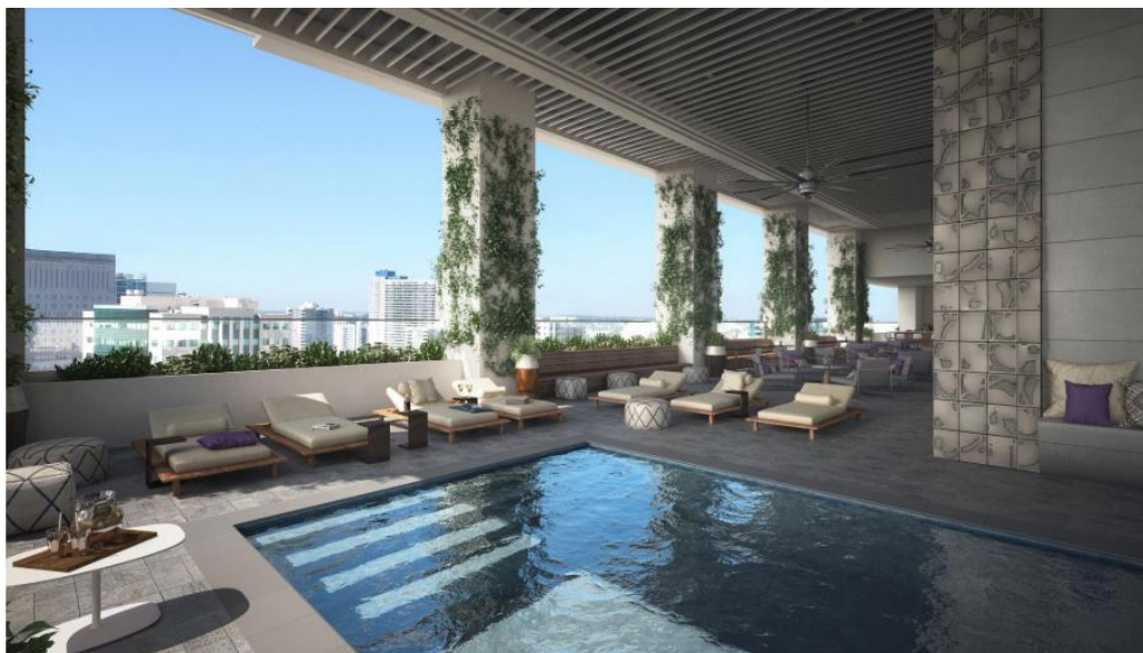
YOTELPAD Miami, image via Aria Development Group

The Stantec -designed building will evenly split its hotel and residential programs, with YOTELPAD occupying floors 15 through 30. Floor plans range from 417-square-foot studios to 708-square-foot two-bedroom units. Residents will have access to both common areas of the hotel and an exclusive penthouse-level Sky Lounge that features a game area, luxury living room and a chef's kitchen with private dining. Additional on-site conveniences include a concierge, gourmet coffee bar, full-service restaurant, fitness centre, co-working space and a pool deck.