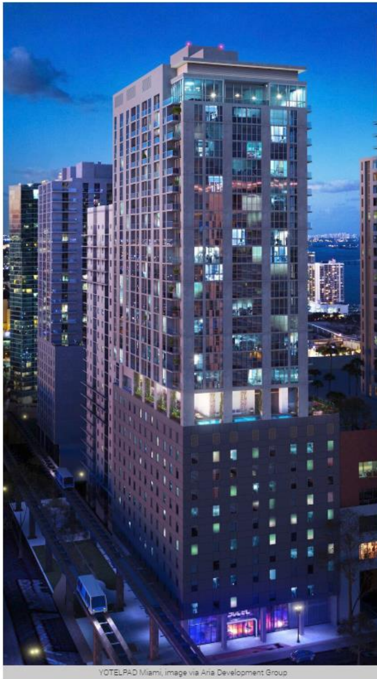
YOTELPAD Miami