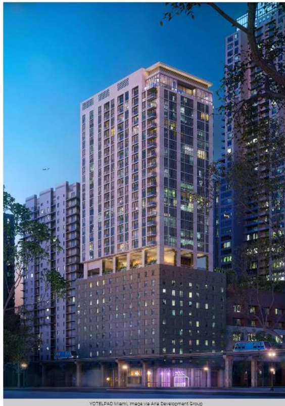
YOTELPAD Miami

After gaining a reputation for its affordable and chic collection of hotels across the United States, the YOTEL brand is extending its values to the residential market. The YOTELPAD brand is a new residential offering under the YOTEL umbrella, and its first East Coast location will soon be making waves in Downtown Miami .